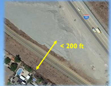
Wildomar (15 freeway)