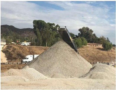
Wildomar (15 freeway)