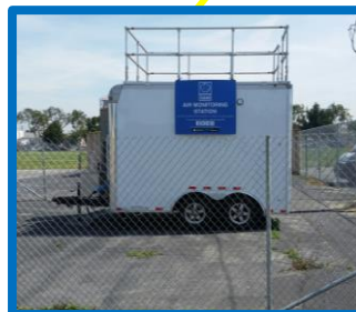
Huntington Park Air Monitoring Station (SELA)

Continuous measurements of multi-metals in PM10 August 2022 to Present