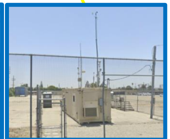
Compton Air Monitoring Station (SLA)

Continuous measurements of multi-metals in PM10 August 2022 to Present