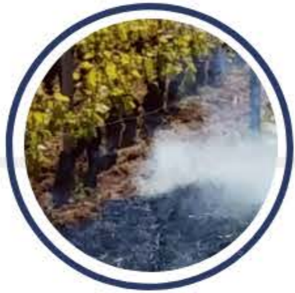
Emergency burning to prevent crops from freezing