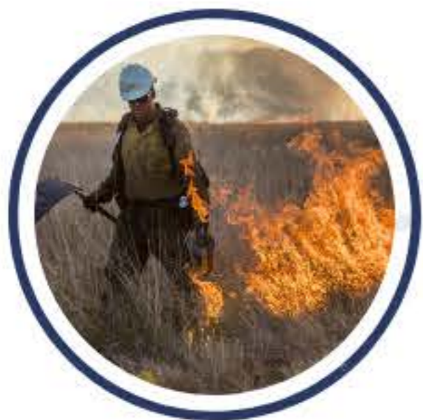
Burning required to reduce fire hazard