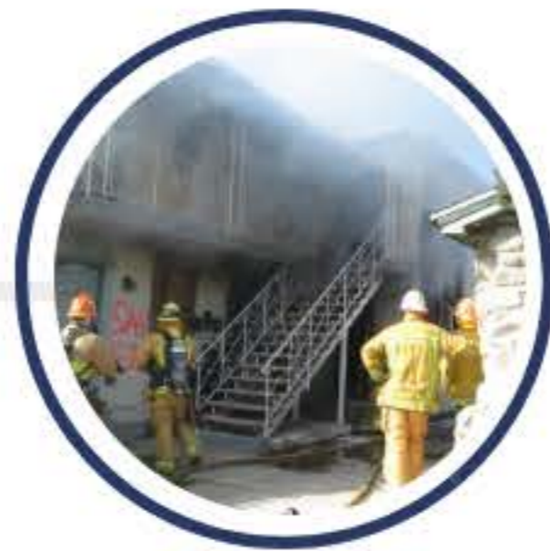
Fire department training