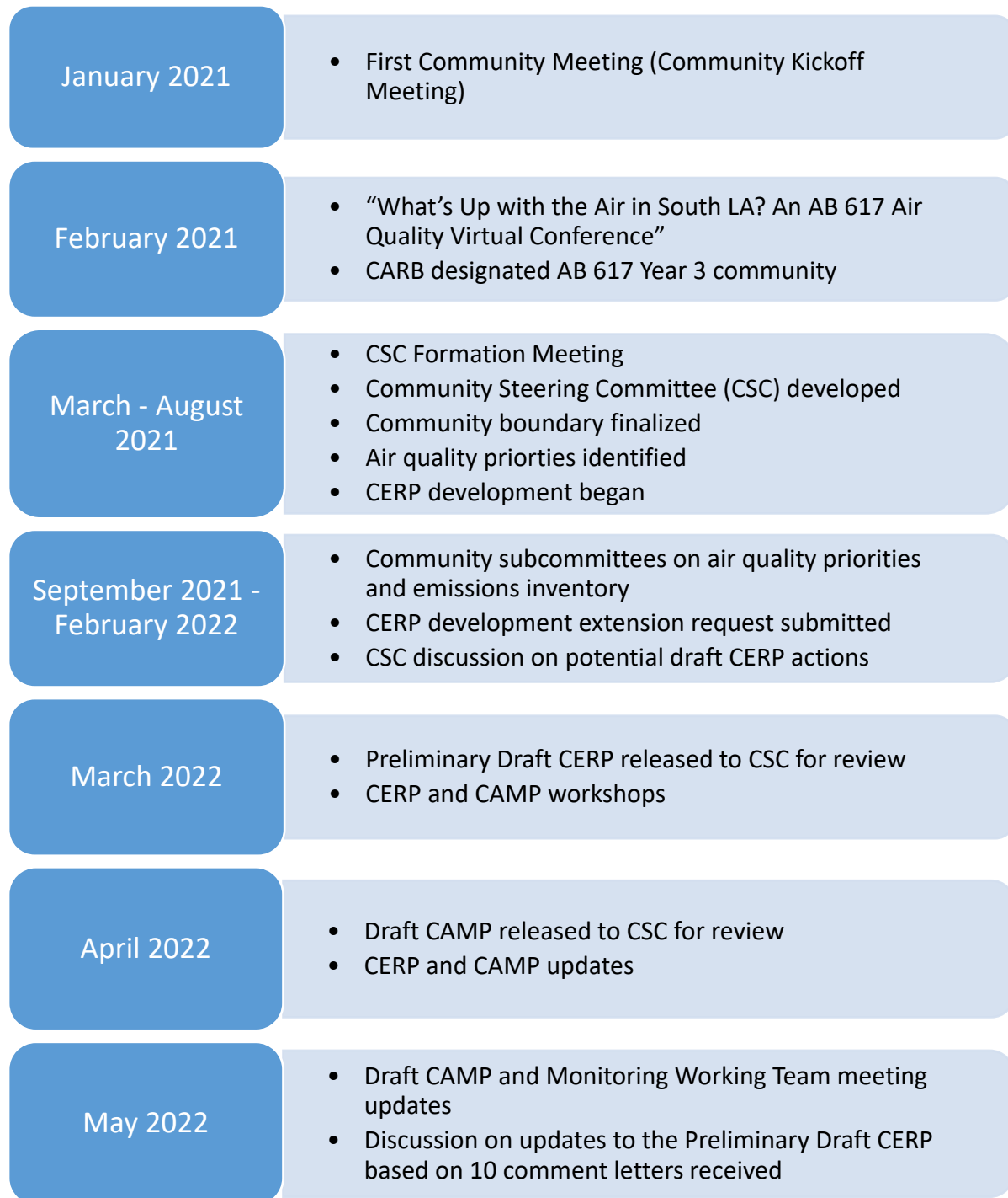
Figure 1-2: SLA Community Designation and CERP Development Timeline