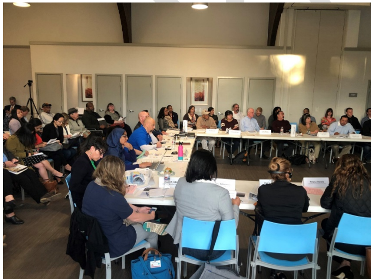
Figure 2-4. Community Steering Committee meeting in West Long Beach

The CSC roster for the Wilmington, Carson, and West Long Beach community is provided in Table 2-1 below. This CSC has 34 primary members, and 21 alternate members. While 12 primary and 5 alternate members are on the roster representing Active Residents, an additional 8 primary and 2 alternates also reside within the community. The roster with member biographies is available on the webpage: http://www.agmd.gov/docs/default-source/ab-617-ab-134/steering-committees/wilmington/roster-with-bios.pdf?sfvrsn=14