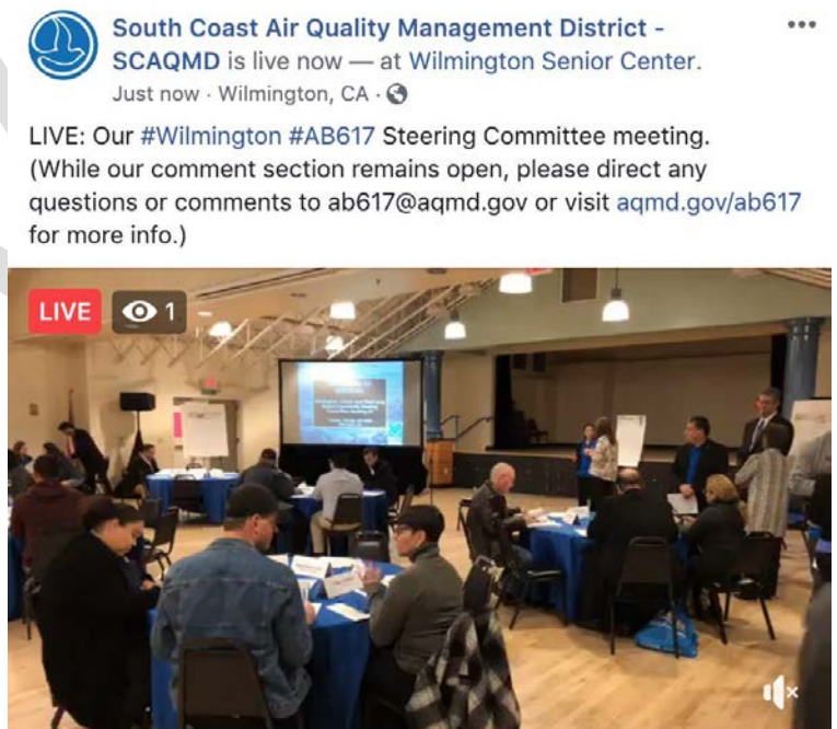
Figure 2-5. Screen shot of Facebook Live recording in Wilmington

Staff received a suggestion from one CSC member to live-stream meetings on social media in order to engage youth who use this technology, and who may not be able to attend the meetings in person. All CSC meetings were subsequently live-streamed using Facebook Live shown in Figure 2-5. The links to the live-stream recording were also posted on the community webpage, so that members who could not attend or view the meeting live could view the recorded video of the meeting. Each video received approximately more than 100 views.