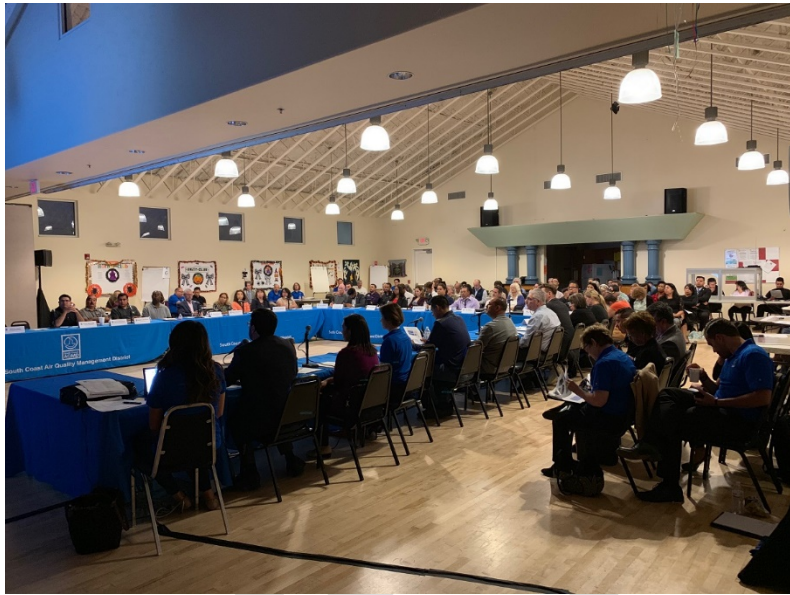
Figure 2-3. Community Steering Committee meeting in Wilmington

CSC membership is comprised of stakeholders with community knowledge to help drive community action. The CSC creates a way to incorporate community expertise and direction in the development and implementation of clean air programs in each community. Staff will continue to seek recommendations and feedback from the CSC as the CERP is being implemented, and adjust the outreach approaches as needed to be even more effective.