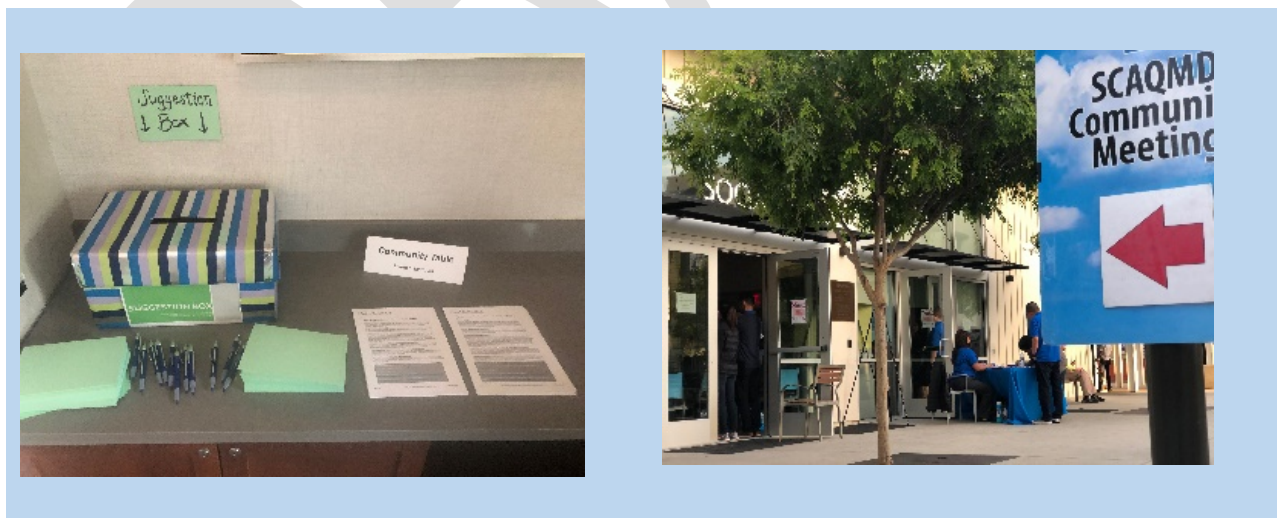
Figure 2-10. Suggestion box and signs for a CSC meeting in West Long Beach

Broader public engagement is also important to the AB 617 program. Suggestion boxes provided at the CSC meetings allows CSC members, as well as the general public, to provide input and suggestions on the AB 617 process (Figure 2-10). Staff reviews the comments after each CSC meeting, and responds as needed. Anonymous submissions are accepted. In addition, a Community Affairs Table at the CSC meetings provides a space for community members to share flyers and handouts about events and programs happening in the community.