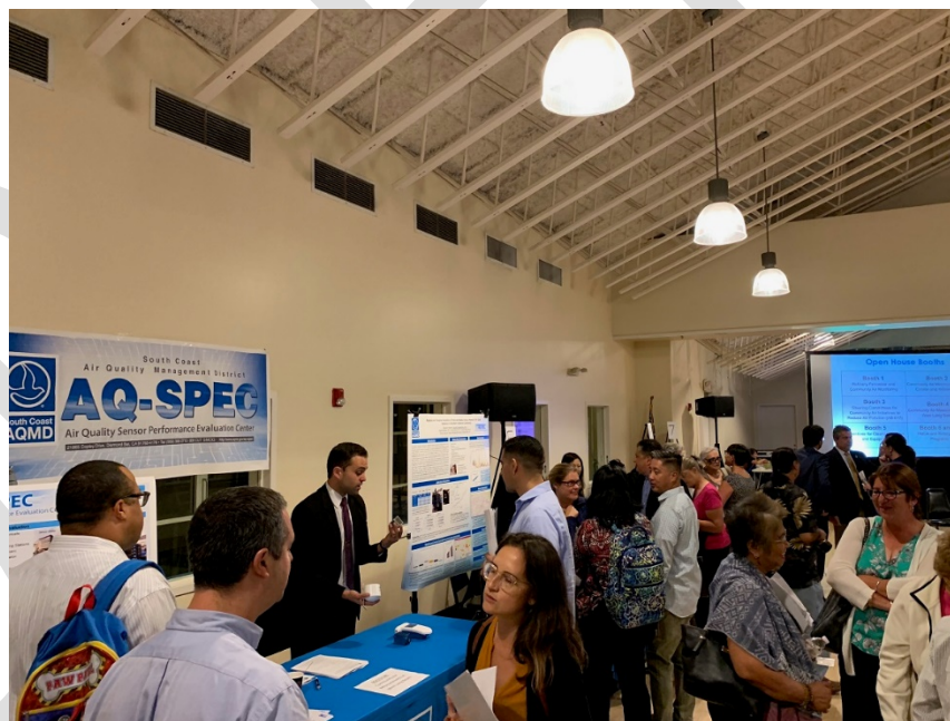
Figure 2-2. Community kick-off meeting in Wilmington fenceline and community monitoring, community air measurement efforts, and incentive programs. Staff from Aclima, Inc. ( www.aclima.io , a technology company that is conducting air monitoring in the community), as well as representatives from the local YMCA and Rotary Club, also provided information at the kick-off meeting booths.

Approximately 120 people attended the meeting. In addition to information about AB 617, attendees were invited to visit a variety of information booths, which provided information about some existing South Coast AQMD programs, including refinery fenceline and community